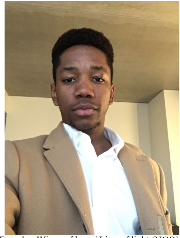
Founder, Wings of hope/ Liter of light (NGO)