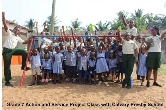
Grade 7 Action and Service Project Class with Calvary Presby School