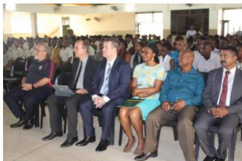
The authorization team join the Coordinators at assembly

After the briefing with staff on the first morning, the authorization team joined the school in the Monday assembly and they were not disappointed.