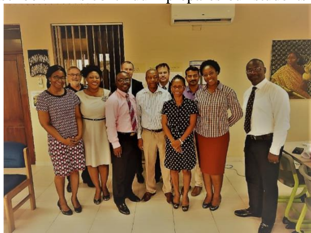
SMT with the authorization team

Another piece of the IB continuum will be put into place once TIS is authorized as an MYP school. This continuum prepares our students to be better equipped for the new DP courses