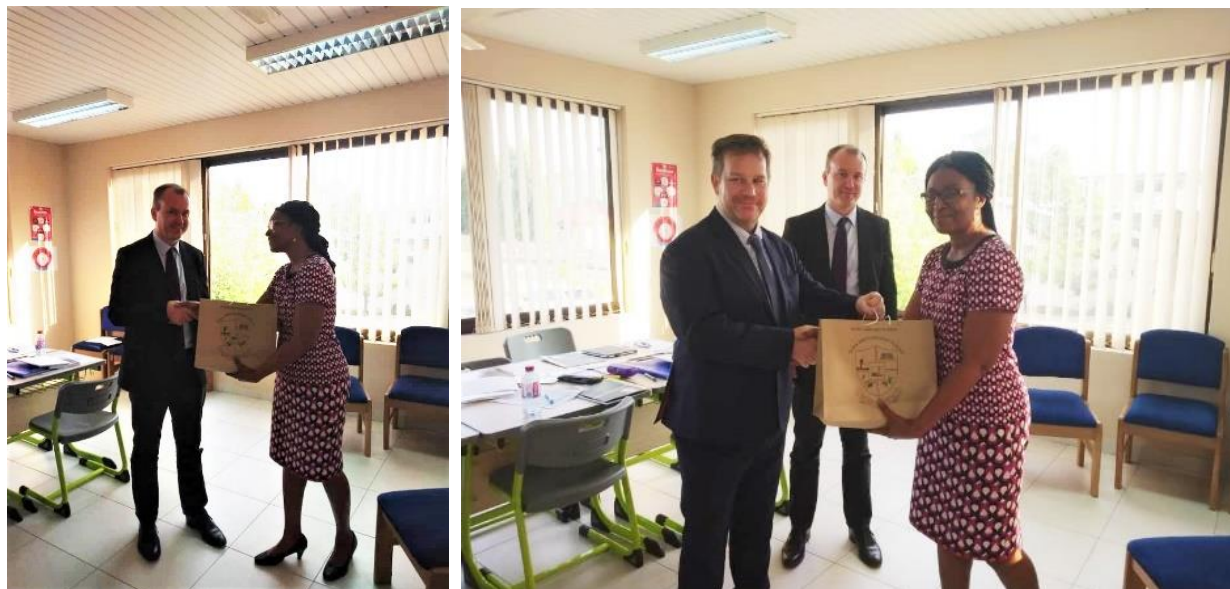
The team are thanked on Tuesday

The authorization team has now left Ghana and it will take a while before we get any news about the result but while we wait, we can all say that this has been a beneficial experience for the school in terms of moving in a new direction.