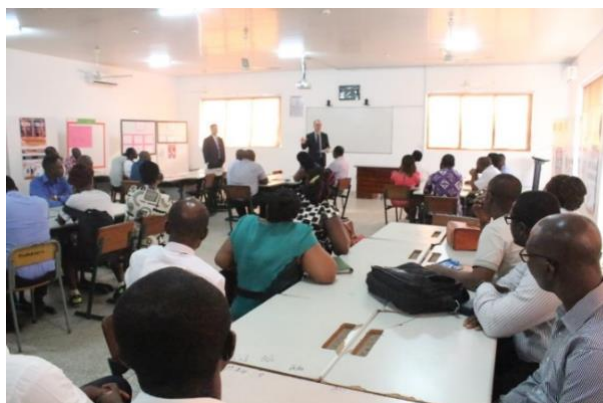
The team meet academic staff

So what happened on Monday and Tuesday? The authorization team met academic staff on the first day to introduce themselves and to explain what they would be doing over the two days which included touring the school, talking to students, staff, SMT, board members and parents and going through documented evidence of our journey so far.